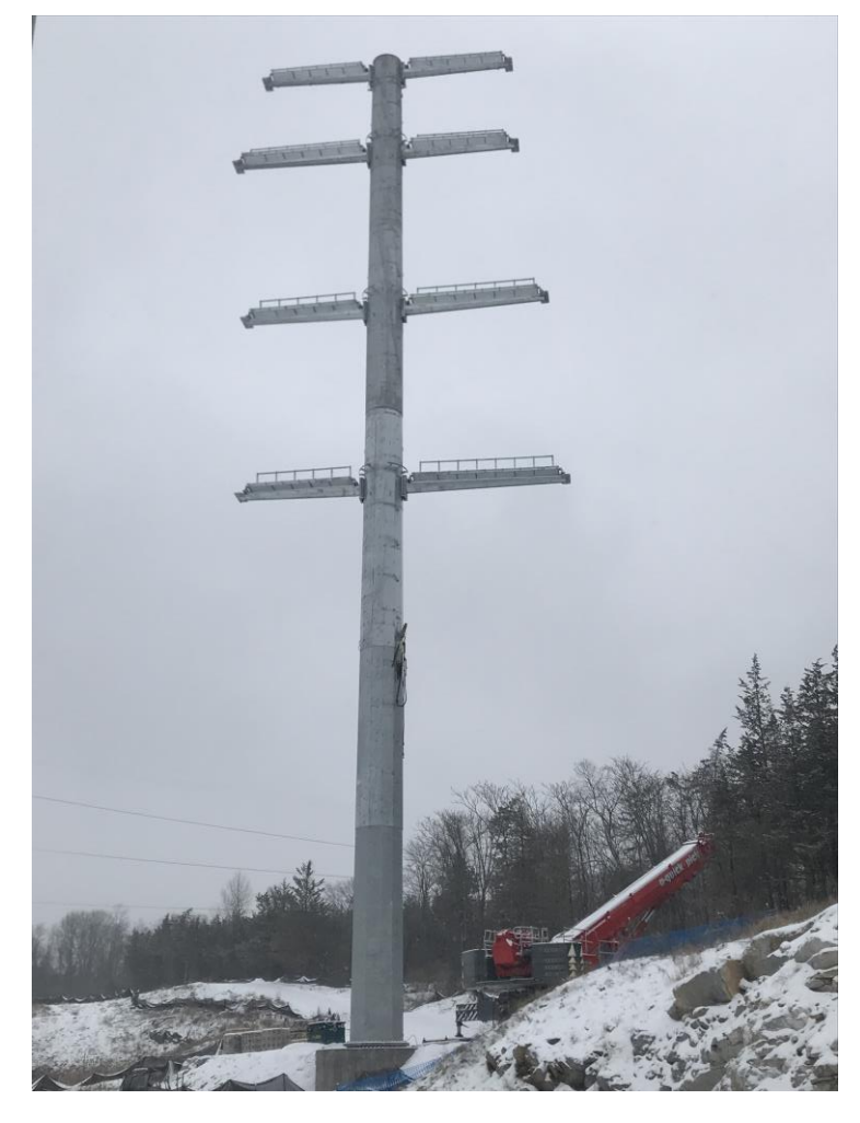
Final Tower Constructed Near CVEC