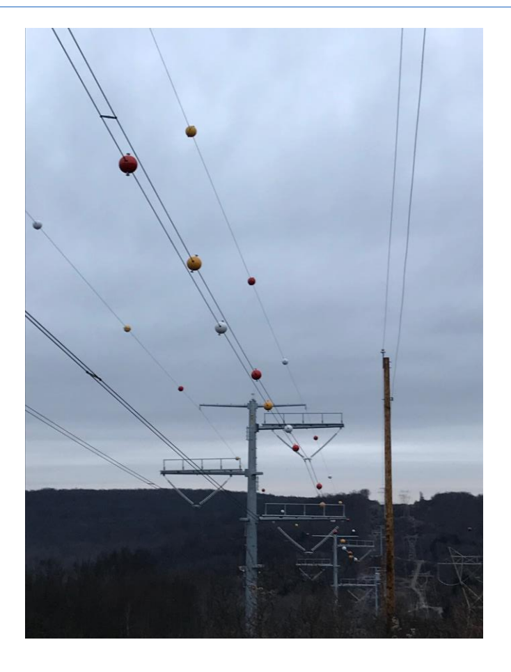
Marker Balls near Sky Acres Airport

✓ Setup for Final Conductor Tie-in to CVEC